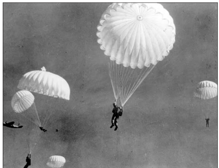
Parachutes reduce the risk of injury after gravitational challenge, but their effectiveness has not been proved with randomised controlled trials